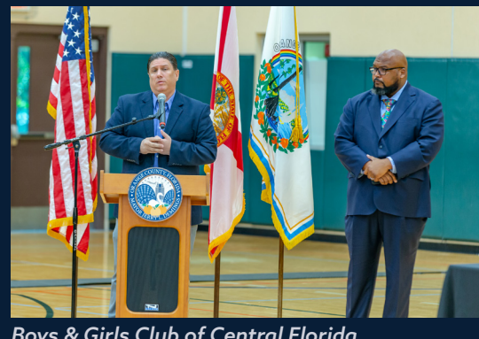
Boys & Girls Club of Central Florida

The Task Force members received numerous presentations from small and large non-profit and faithbased agencies providing prevention and intervention services throughout the county. The agencies listed below are funded through the Orange County Citizen Safety Task Force and the Orange County Citizens Commission